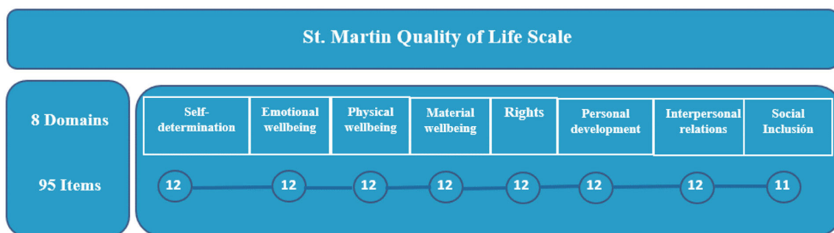
Figure 1. Structure of the San Martin Scale, showing the breakdown into eight domains and ninety-five items. The items are related in each dimension. All dimensions have 12 items, except for the social inclusion domain, which has 11 items. Own elaboration, based on the Scale Manual 26 (see Supplementary material).

When the San Martin Scale is administered to an individual, the responses that the individual has given per question (item) are obtained. By adding the responses for each item, the total direct scores for each dimension are obtained. Having the total direct scores of the dimensions, these are transformed into standard scores, using Table A in Annex A of the San Martin Scale manual 26 . Once having the standard scores for each dimension in on are obtained, they are summed up to obtain the total standard score. This total standard score is converted to a QoLI using Table