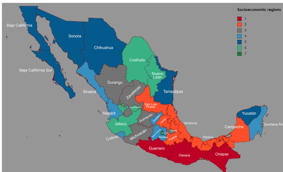
Figure 1. Geographic distribution of the socioeconomic regions of Mexico.

23% by 2050. 8 The consequences of this transition probably will be an increase in prevalence and mortality due to some diseases such as PD. Concerning the prevalence of PD in Mexico, previous studies had reported an overall incidence rate of 37.92/100,000 (incidence density of 9.48/100,000 person-years) for the 2014–2017 period, but when stratified by age, in the ≥ 65 population it was 313.94/100,000. The incidence rate was higher in men than in women (42.22 vs. 34.78/100,000, respectively). 9