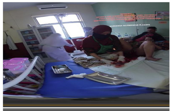
Fig. 4. Display warning.