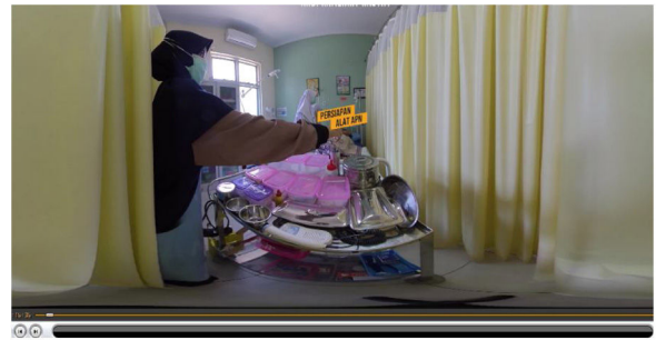
Fig. 1. Tool preparation display.

A VR-based learning media product was born at this stage, which had undergone a development stage to produce the third childbirth care learning media. Students use this media as a tool in the learning process that is flexible, interesting so that it can trigger student motivation to improve their skills (Figs. 1–4).